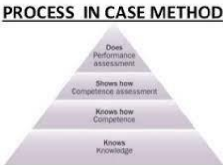
Figure 2. Diagram Case Method

Results of Cycle II Research 1. Planning Stage The planning stage is carried out by preparing a Semester Learning Plan (RPS) still using the case method, but the case to be solved is first