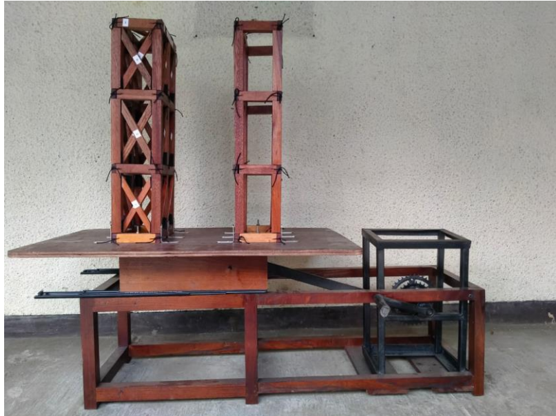
Figure 1. View Design