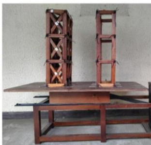
vibration table and building